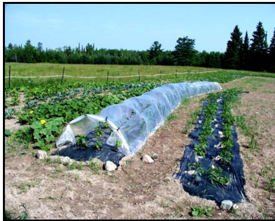
Clear slitted plastic Field Tunnel supported by wire hoops.